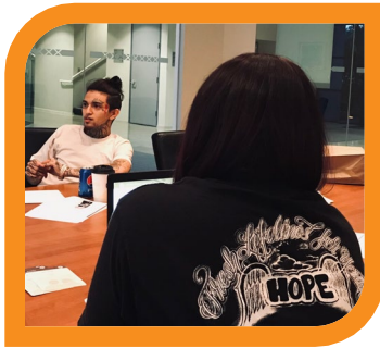
Law Related Education