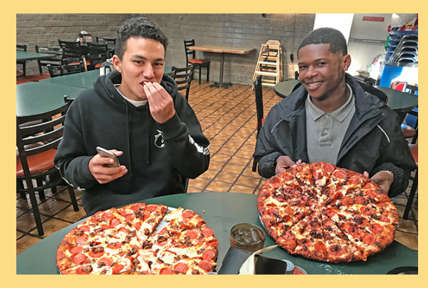
Two FLY Reentry Program youth had birthdays on the same day, and their case managers surprised them with their own extra-large pizzas.

FLY's Reentry Program launched in San Mateo County.