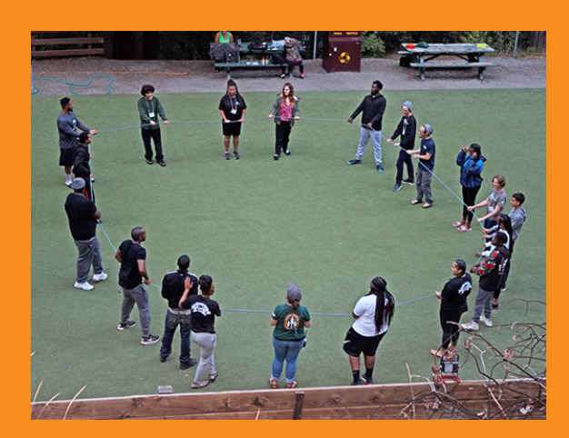
Youth who have just begun FLY's Leadership Training Program with a three-day retreat complete an activity to encourage inclusiveness and teambuilding.

partnerships. After nine months of operation, the Task Force handed responsibility to a permanent DEI Committee.