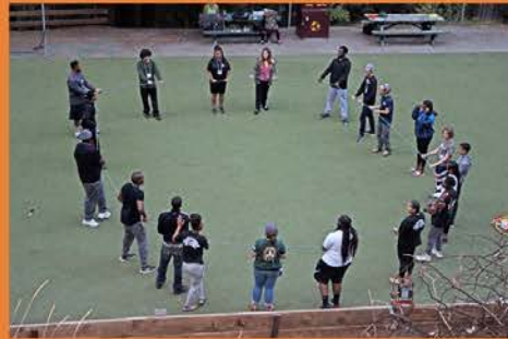
Youth who have just begun FLY's Leadership Training Program with a three-day retreat complete an activity to encourage inclusiveness and team-building.

operation including external partnerships. After nine months of operation, the Task Force handed responsibility to a permanent DEI Committee.