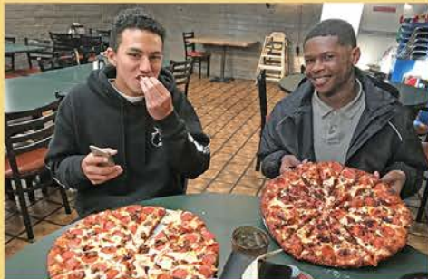
Two FLY Reentry Program youth had birthdays on the same day, and their case managers surprised them with their own extra-large pizzas.

FLY's Reentry Program launched in San Mateo County.