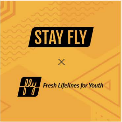
T Lab developed a compelling visual direction for STAY FLY and used it to create a comprehensive set of materials for classes and social media.

Look for more news about these exciting developments at FLY.